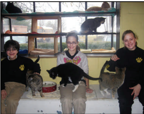
Critter Crusaders from Kammerer's "Critter Club" have a MEOW-velous time volunteering at the Animal Care Society in Louisville, KY.