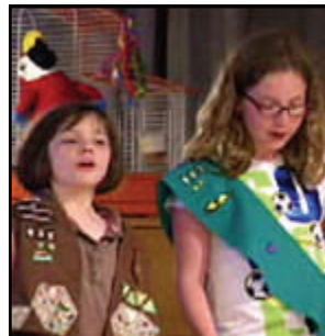
Kids sang Critter-okee songs at the Animal Gambill show