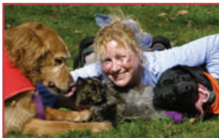
Riley, Animal Gambill, Hobo Kitty, and Lordy having a BOW-WOW BLAST!

Anyway, back to me...I like going for walks, I like swimming and I like trying to get treats out of my funky rubber dog toys. Hobo Kitty thinks my toys are goofy because she is into that catnip stuff, but I