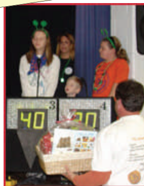
Tail Waggin' Trivia is a Bow-Wow Blast!

Join us for a FUR-ific time on June 13th!